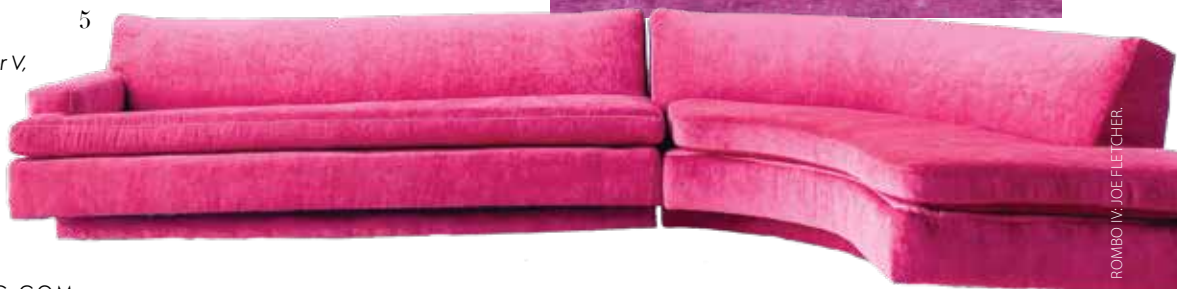
ROMBO IV, JOE FLETCHER